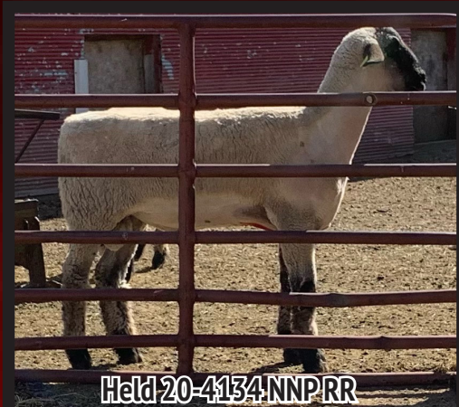
Held 20-4134 NNP RR

Check website for updates in consignments to the Midwest Sale. || Inquiries and visitors always welcome!!