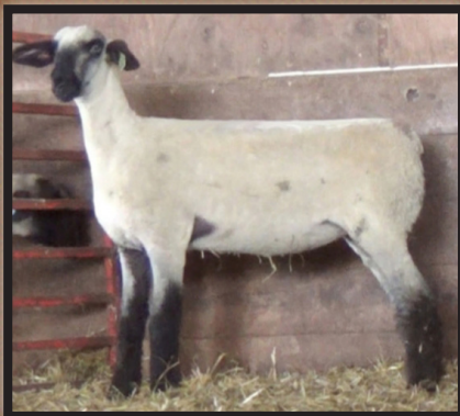
JANUARY EWE LAMB