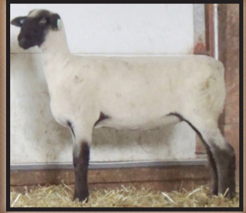
JANUARY EWE LAMB

SIRED BY ENCORE SOLD TO GRANT BASTING, IL