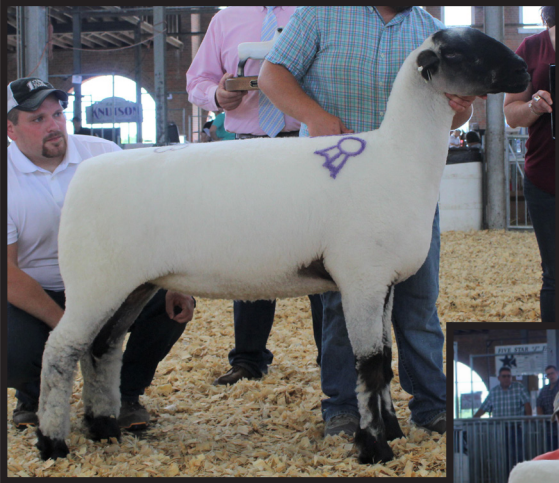
2019 Grand Champion Ewe Senior Champion consigned by Alf Hampshires, WI sold to Foundry Acres Hampshires, MA for $1,300