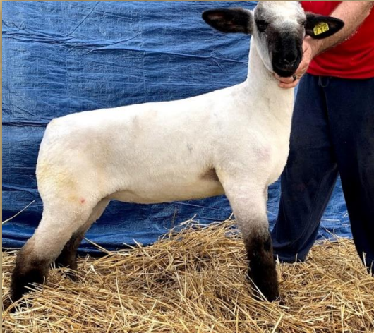
January 2021 Ewe Lamb sold to Minnesota along with a Yearling Ewe One or Two More in the Barn with Similar Futures for Possible Sale

“Hades”, Our Person Ram, Has Stamped 2021 Lambs with Extra Thickness. Heavy on Rams this Year Including a Couple Smaller- framed Rams, Extra Thick Body Types