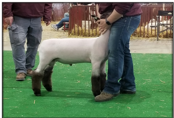
RESERVE CHAMPION WETHER SIRE DANIELS CLUB LAMBS, IN