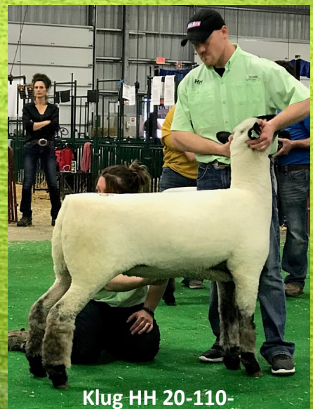
Klug HH 20-110-