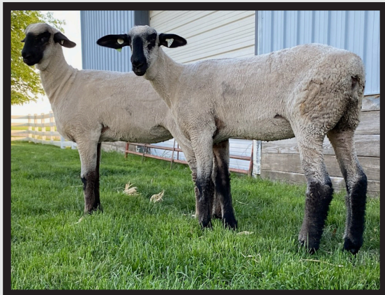
Ewe lambs sired by Fuzzy