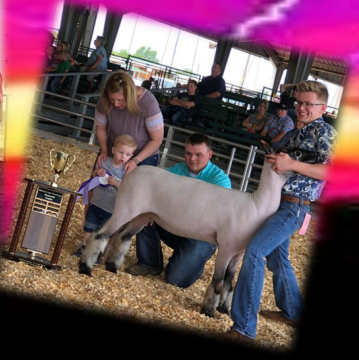
Final Touch Daughters