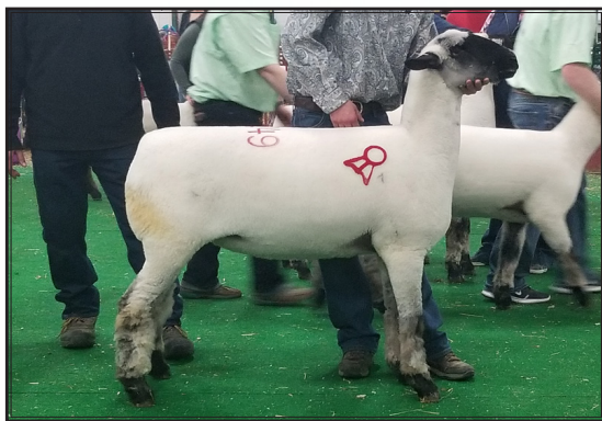
CHAMPION EWE CLEARVIEW FARM, IL