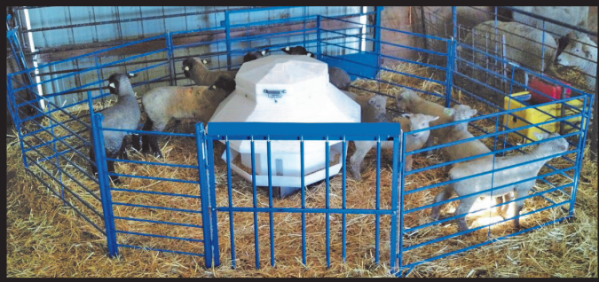
#150A OUTSIDE/INSIDE CREEP AREA