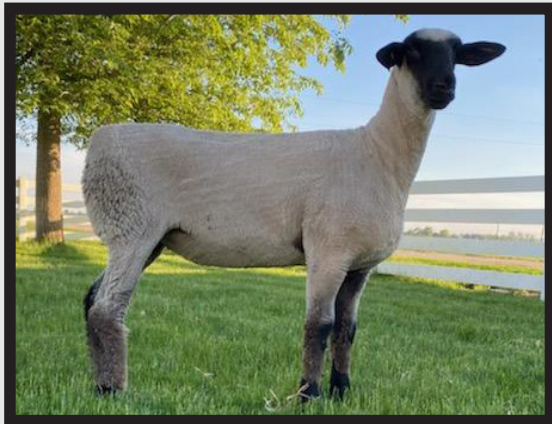
Ewe lambs sired by Absolute