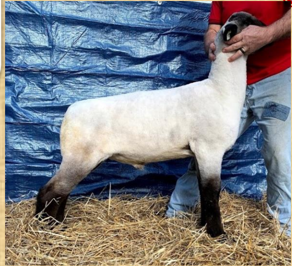
January 2021 Ram Lamb Sold to South Dakota Plenty More in the Barn Just Like Him

“Hades”, Our Person Ram, Has Stamped 2021 Lambs with Extra Thickness. Heavy on Rams this Year Including a Couple Smaller- framed Rams, Extra Thick Body Types