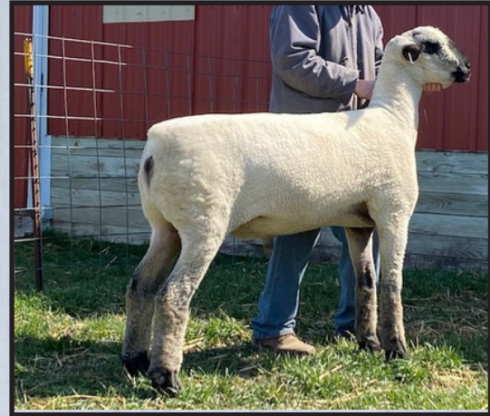
Lot #12 Bobendrier 20-129 Ram Lamb - Sold for $2,000

Lot #14 Chapin 238 RR NNP Seller: Chapin Hamps - Bill Chapin Buyer: EH Ranch - Reliance, SD Sold for: $300