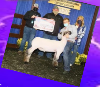
Bob Ross 2020 Lambs