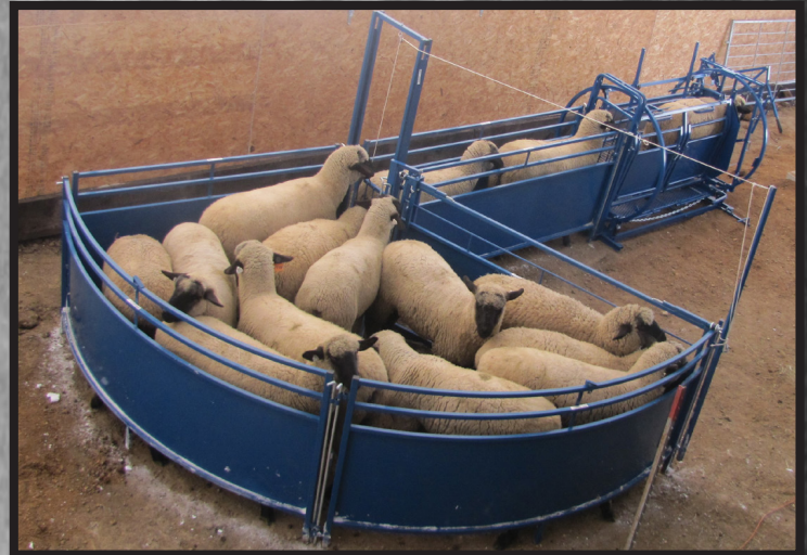
#987A SYSTEM E WORKING SYSTEM WORKING SYSTEM WITH #938-2 DELUXE SPIN DOCTOR OTHER DESIGNS AND LAYOUTS AVAILABLE