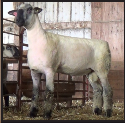
FALL RAM LAMB

OUR 9TH ANNUAL "SHARING THE GENETICS" SALE AVERAGED $1300