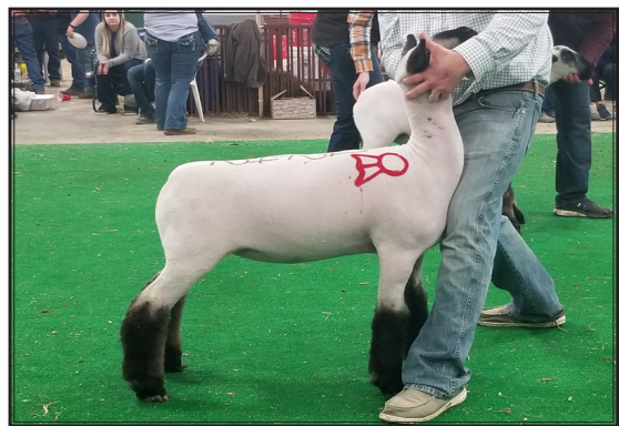
RESERVE CHAMPION EWE SCARLET ACRES, OH