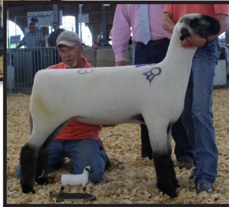
2019 Reserve Grand Champion Ewe Junior Champion consigned by Held Hampshires, SD sold to Suehs Hillside Hamps, WI for $2,000