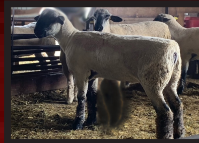
Held 20-4119 NNP RR