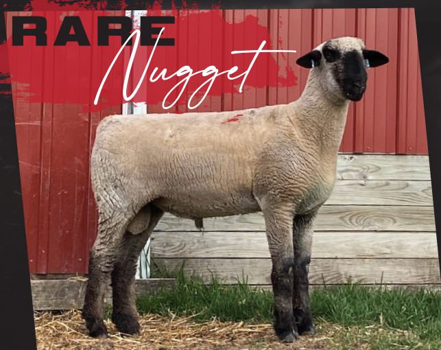
Bobendrier 19-104 RR

Sire: Rare Legend 1st Place Yearling Ram · 2020 NAILE