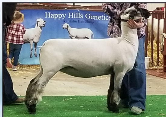
CHAMPION WETHER DAM FLEENER LIVESTOCK, PA