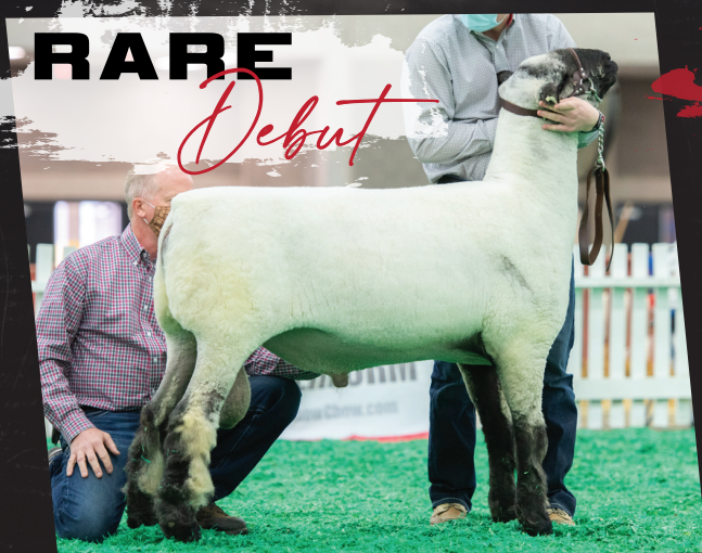
Bobendrier Boys 19-60 RR

Sire: Rare Legend 1st Place Yearling Ram · 2020 NAILE