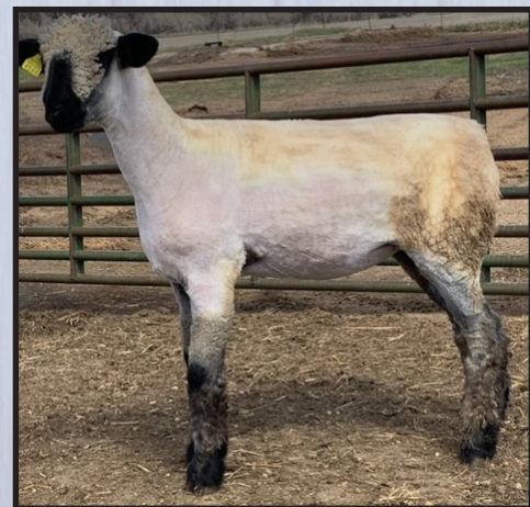
Lot #6 Held 20-4166 Ewe Lamb - Sold for $1,000