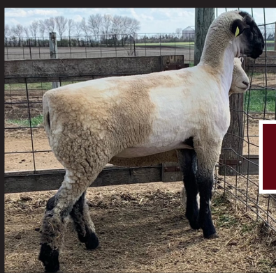
Held 20-4168 NNP RR

Purchased by Taylor Stock Farm KY. This buck has all the tools to excel in the showing and add finishing touches to the genetic base in the Taylor flock! Really excited for the future in this fall ram!!!