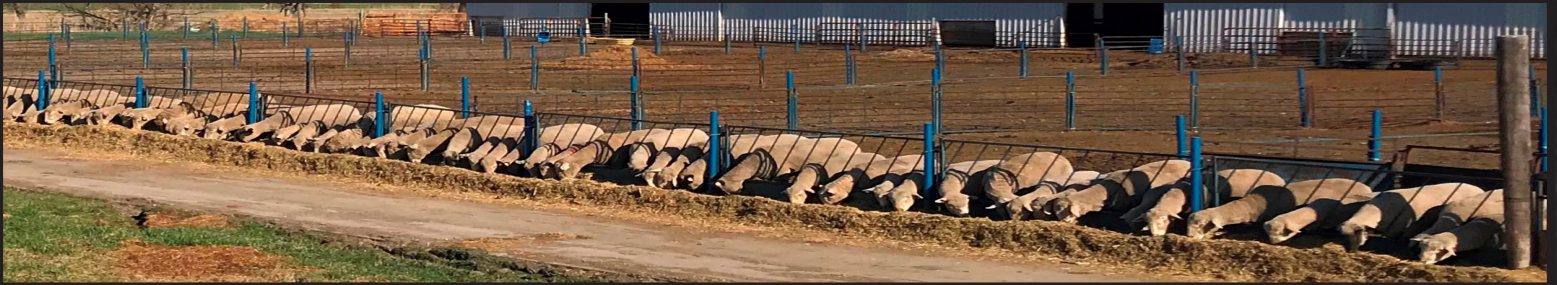
#880T HAY PANELS 7 1/4" SPACINGS