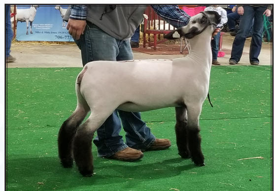
RESERVE CHAMPION WETHER DAM SCARLET ACRES, OH