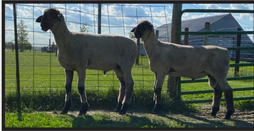
Ram lambs sired by Willwerth 28 Fuzzy