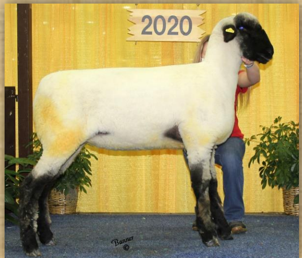
“Brittany” 2 nd Place Fitted Fall Ewe Lamb A Good Example of “Chapin” Sheep! NAILE 2020

Sound, Honest, Complete & Consistent Hampshire Sheep