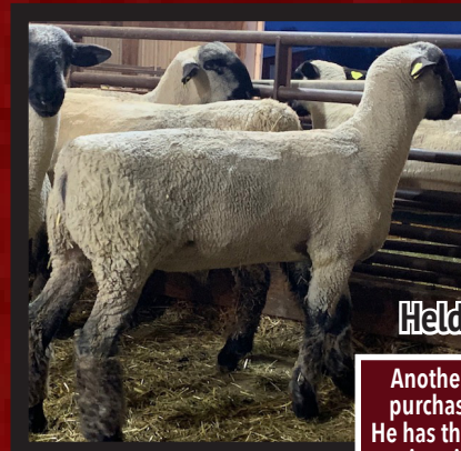
Held 20-4123 NNP RR