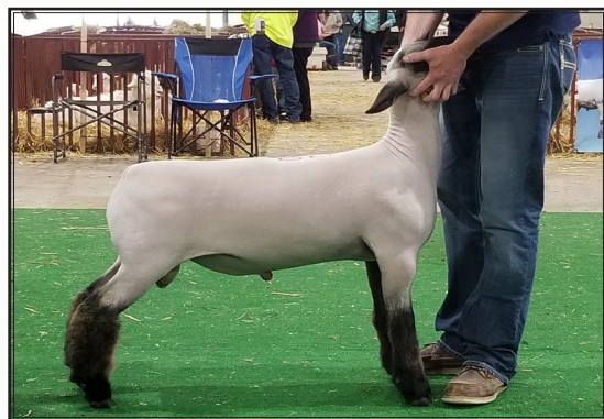
CHAMPION WETHER SIRE SLENTZ FARMS, IN