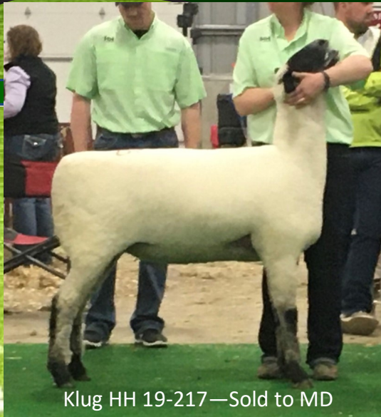
Klug HH 19-217—Sold to MD

We've got an exciting set of Hampshires and Southdowns lined up!