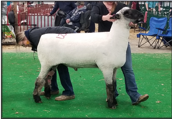
CHAMPION RAM PERSON HAMPSHIRE, IL