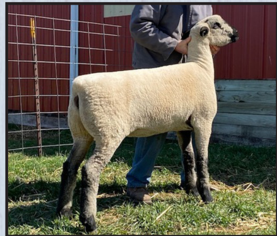
Lot #5 Bobendrier 20-121 Ewe Lamb - Sold for $1,800